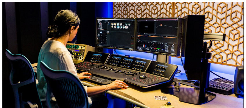
Media production in process at twofour54.

As a post-production service provider, twofour54 not only creates and archives original content and finished Avid and non-Avid assets for their in-house internal projects, but also provides similar services for their clients. They offer their clients the option of storing their projects on various storage mediums, including LTO tape. To fulfill this offering, twofour54 searched for a standard LTFs-based solution that could deliver finished assets and would be readily available and broadly adopted across the industry, while fitting into their clients' workflows.