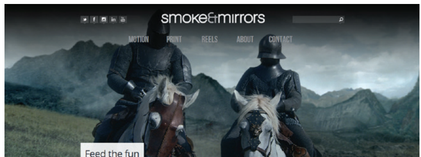
Image from the home page of the Smoke & Mirrors website

Smoke & Mirrors needs to store live jobs that can scale up to 6TB each and total up to 150TB per client. The initial capital cost of the new system and on-going operating costs were key considerations, given the massive petabytes of data Smoke & Mirrors manages on a regular basis. Cost considerations included the data centre expense of storing that data as well as scarce and very expensive office space in central London. In addition, the Smoke & Mirrors team wanted knowledgeable, continuous vendor support to be part of the package.